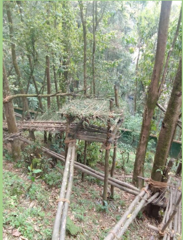
Fig: Enrichment at Red Panda Enclosure at Old Conservation Breeding Centre