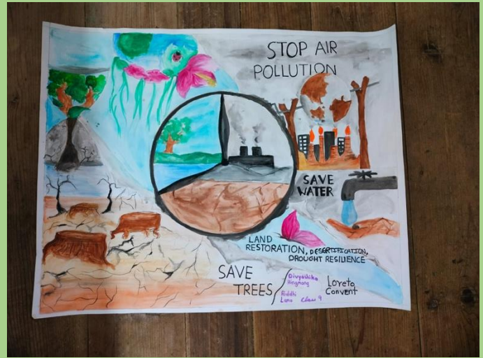
2 nd Place