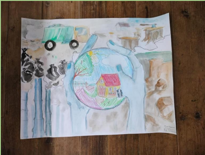
1 st Place