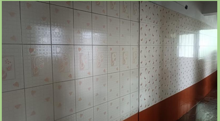
Fig: Repair & maintenance of Toilets at PNHZP