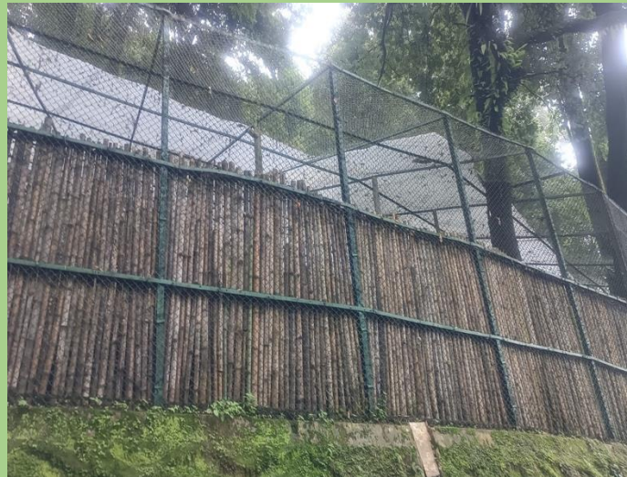
Fig: Visual barrier at snow leopard enclosure