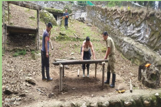
Fig: Building of feeding Platform at herbivore enclosures