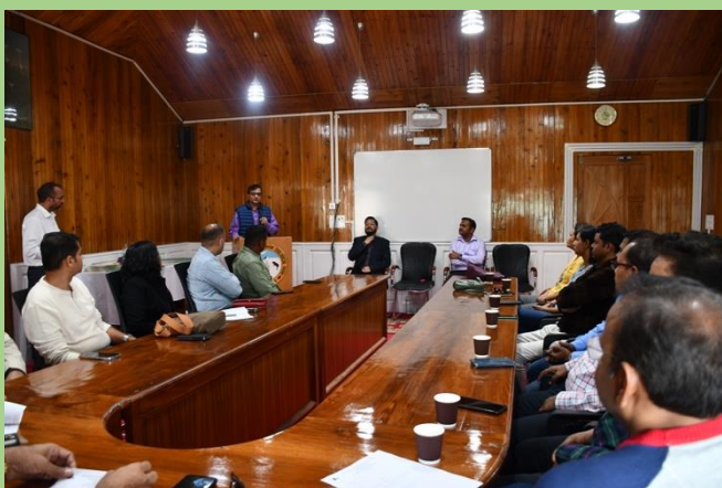
Fig: Education visit of Indian Forest Service Officers on 01.05.2024