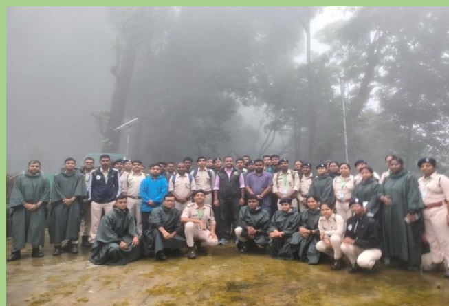
Fig: Education visit of 19 th Batch, North India Exposure Tour on 28.07.2024