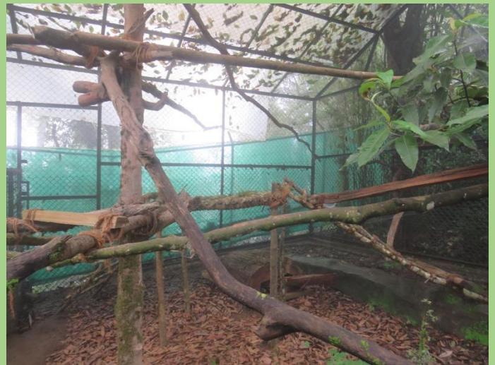
Fig: Aerial walkways at lesser carnivore enclosure