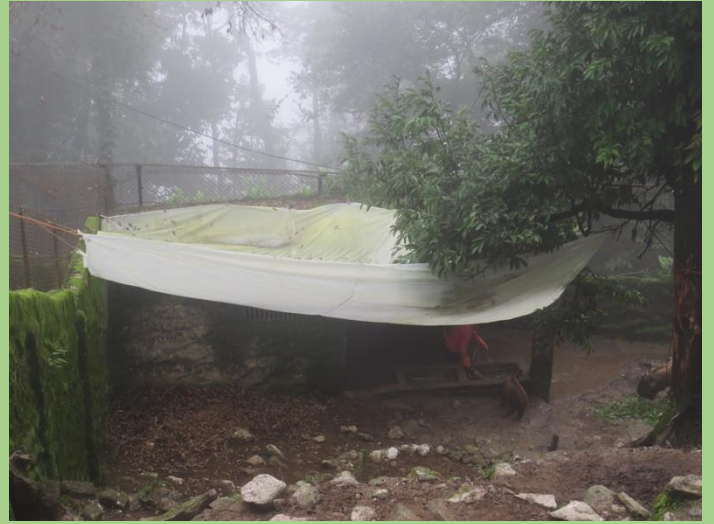
Fig: Pre-monsoon enrichments at herbivore enclosures