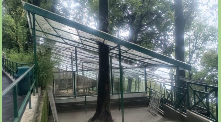
Fig: Development of new Snow Leopard enclosure at PNHZP